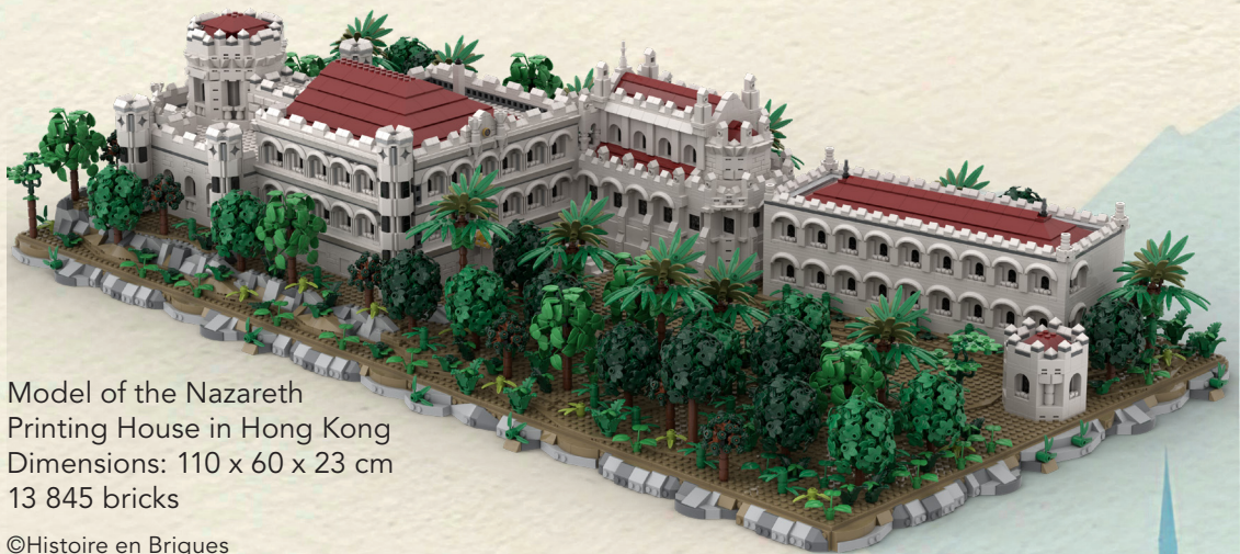
Model of the Nazareth Printing House in Hong Kong Dimensions: 110 x 60 x 23 cm 13 845 bricks

The exhibition begins with the history of the founding of the MEP, from the establishment of its seminary to the first missions in Asia. It notably addresses the instructions that define the missionary work of MEP priests, as well as their role in the dissemination of written works in Asia.