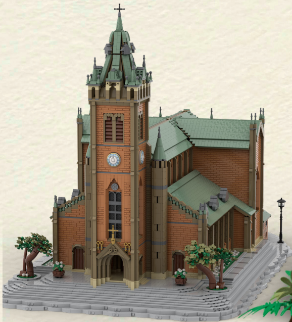
Model of Myeongdong Cathedral in Seoul Dimensions: 103 x 60 x 67 cm 16,333 bricks