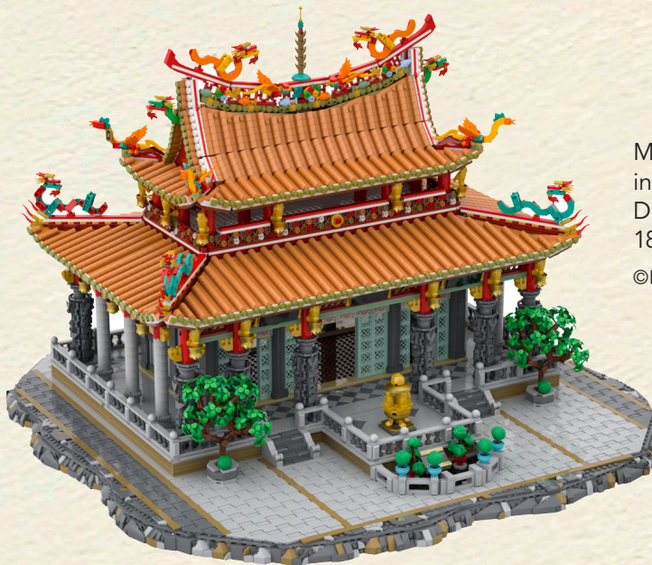
Model of Longshan Temple in Taipei Dimensions: 71 x 71 x 50 cm 18 547 bricks

Asia is marked by the great diversity of its people, heirs to very ancient cultures. The continent is the birthplace of the three major monotheistic religions. It is also the cradle of Hinduism, Buddhism, Taoism, Confucianism, and many other religions and spiritual traditions. The exhibition explores interfaith dialogue within its Asian context (Mission – Dialogue – Harmony) and the question of coexistence. The major religions practiced in Asia are presented through five emblematic models representing each faith.